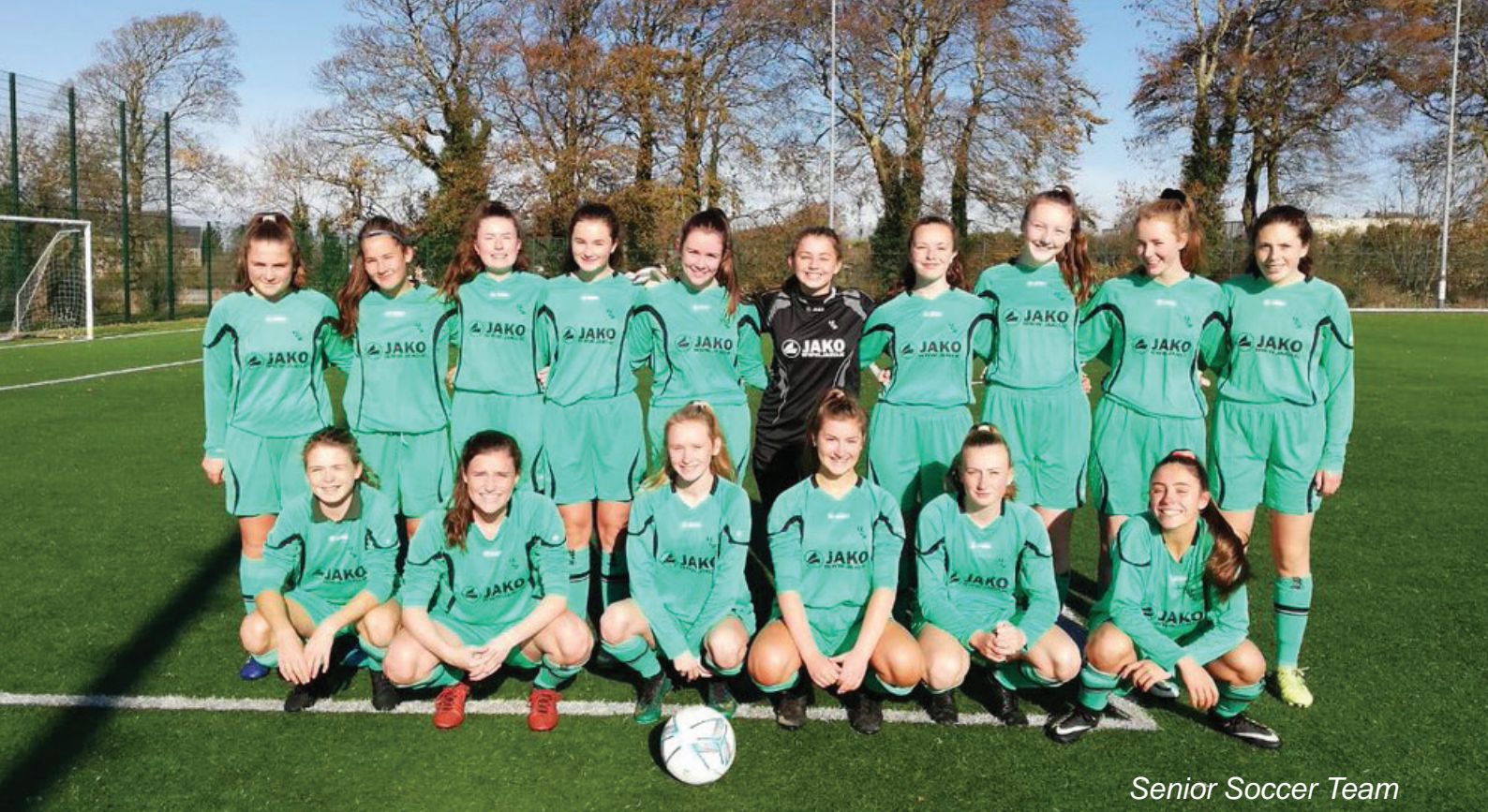
Senior Soccer Team