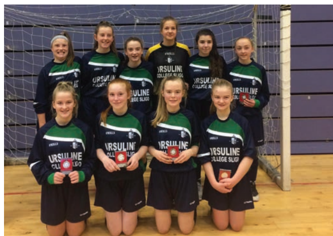
2nd Year Futsal Team Silver Medalists