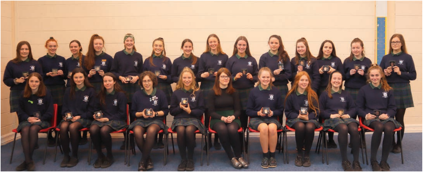
Gaisce The President's Award