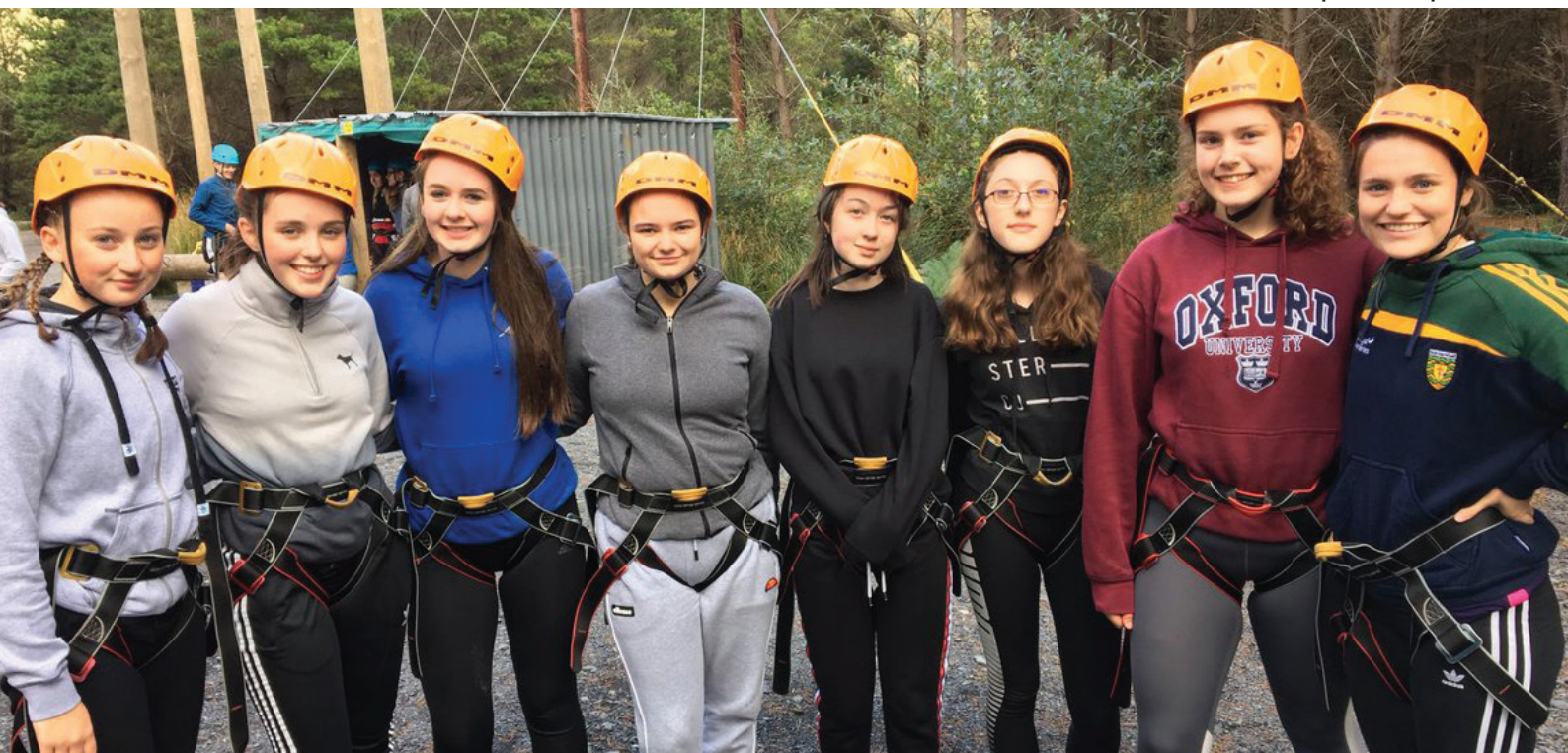
TY Trip to Delphi

Students enjoy two sessions of Work Experience – one in the first term and one in the second term. All students take part in the Transition Year Musical which is staged during the second part of the year. This is one of the highlights of the year according to many Transition Year students.