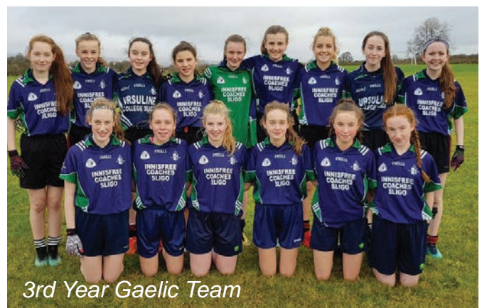
3rd Year Gaelic Team