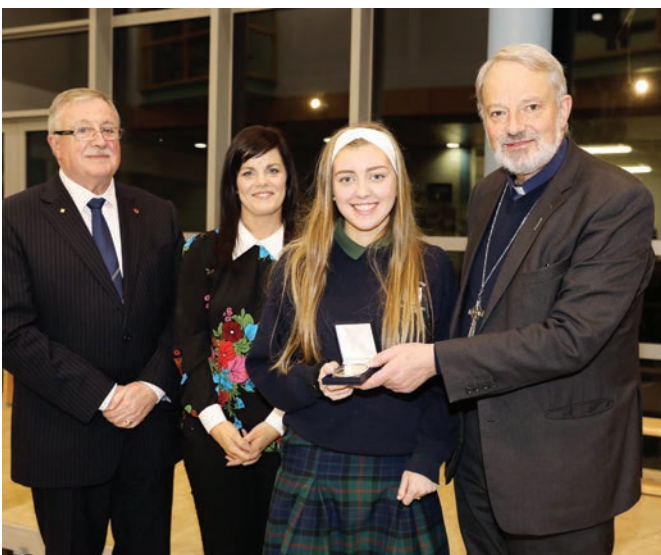
John Paul II The Papal Cross Award