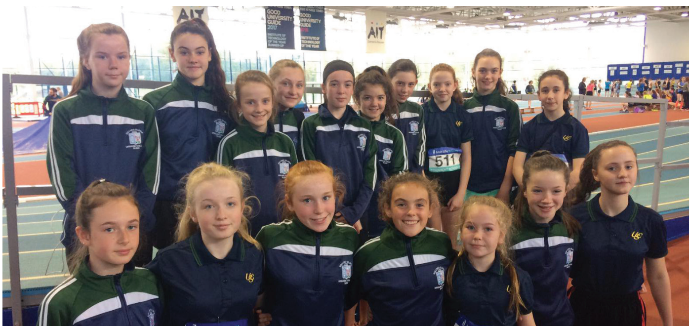
2nd Year Indoor Athletics