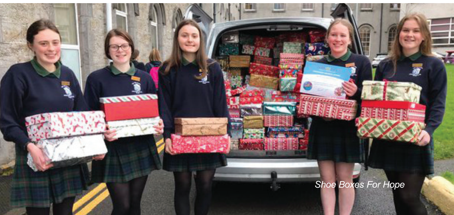
Shoe Boxes For Hope

The election of two parents to the Board of Management