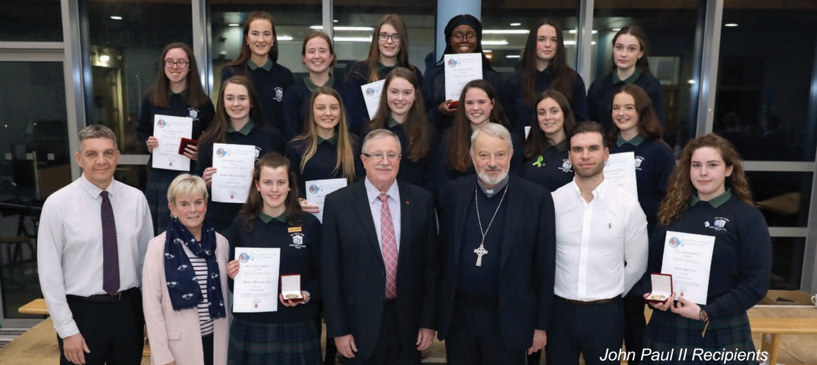
John Paul II Recipients