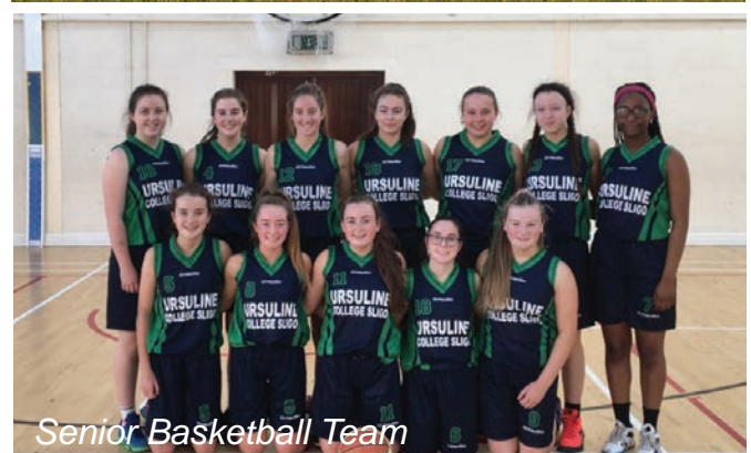
Senior Basketball Team