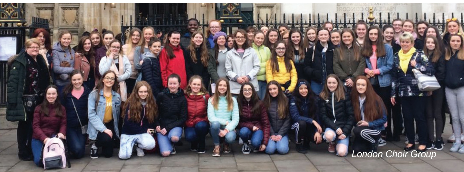
London Choir Group