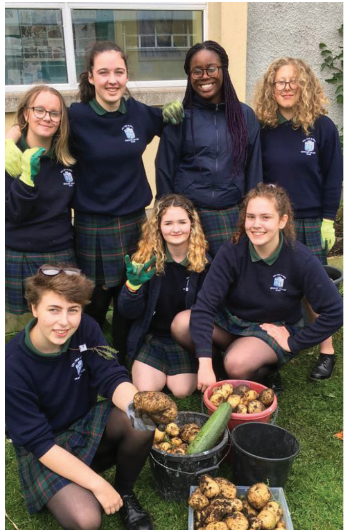
Green Council School Garden

An Active Ursuline Green Council is hard at work promoting a clean and sustainable environment for both students and staff. The Green Council encourages everyone to take an active role in caring for the environment.