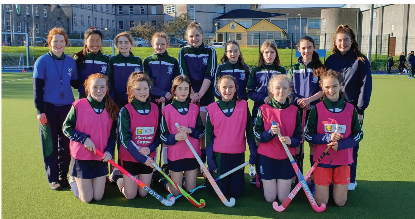
Second Year Hockey Fun Activities