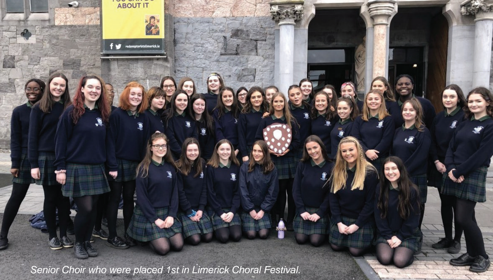
Senior Choir who were placed 1st in Limerick Choral Festival.