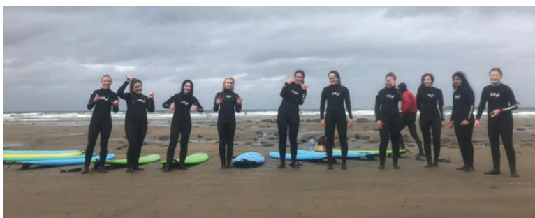
Surfing the waves in Strandhill