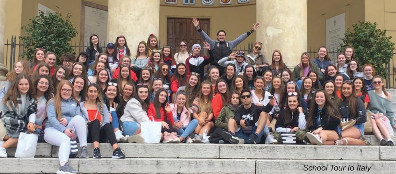
School Tour to Italy