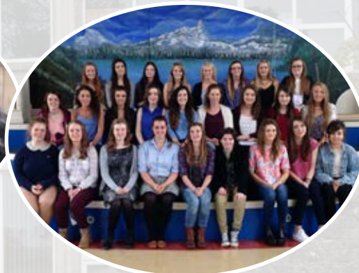
Leaving Certificate Students who scored more than 500 points