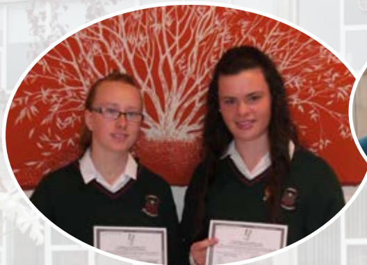
Achieved 11 A's Junior Certificate 2014