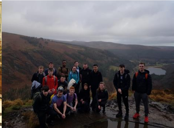
Our students receiving their Pope John Paul II Awards