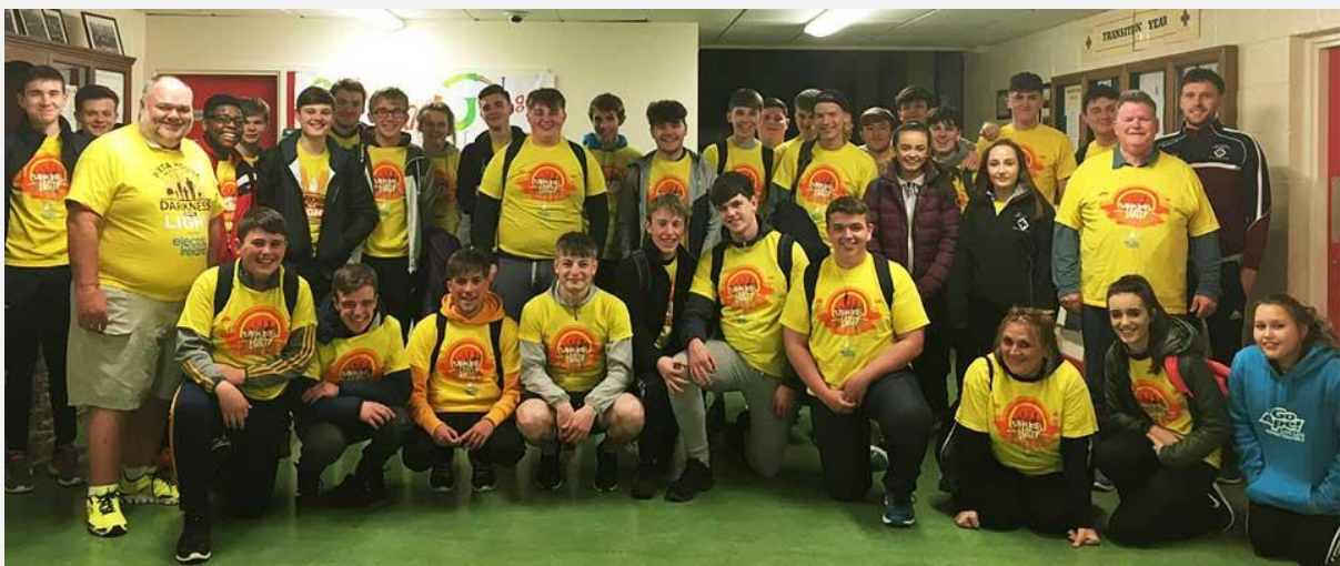
Students raising Mental Health Awareness by partaking in the Darkness into Light Walk

Students with specific learning difficulties are catered for through the provision of a Resource Teaching service in the school. Specialist help is available for students with general learning difficulties through the learning support team, working in co-operation with subject teachers. This support can be offered on an individual, small group, in-class or whole class basis. Special Needs Assistants offer other support to individual students and are an important part of the Learning Support team.