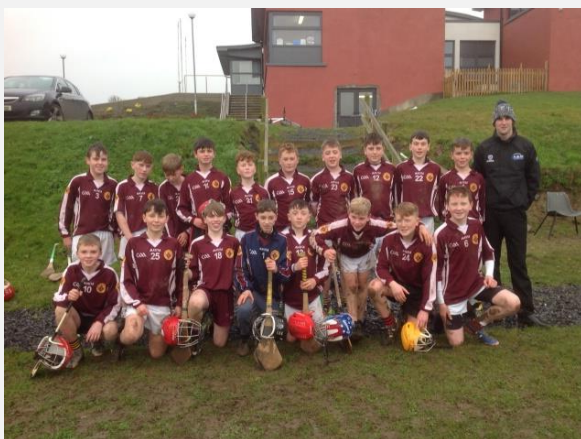
1 st Year Students winning their Leinster Division

St. Ciarán's Community School sports ethos is intrinsically linked to our Mission Statements aim of supporting development makes available as many sports as possible to as many students as possible.