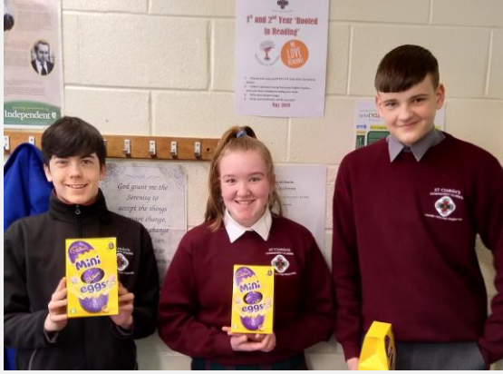
Our "Rooted in Reading" winners